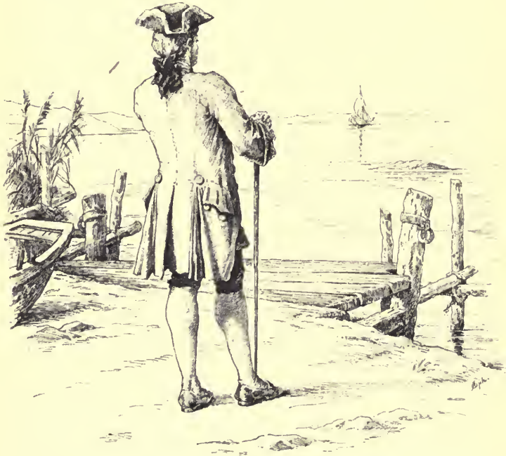
'Where Harry stood motionless.'

He hid, and wandered up and down, till near dinner-time. At last, O'Shane's boat was seen returning—but no white